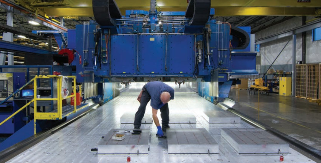
AMI Metals, Inc.